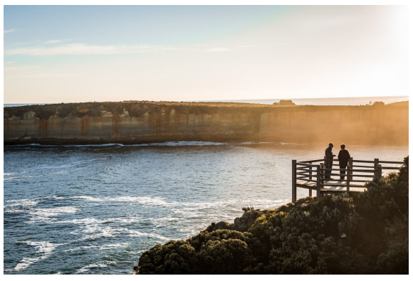
Blue Platform workshop 'Mapping perspectives of the blue bioeconomy in the Baltic States' on 22-23 April in Riga, Latvia

Aquaculture has become one of the most promising sectors of the maritime economy in terms of growth and job potential in the Baltic Sea Region. On 1 April 2020, Blue Platform is organising its second workshop with the aim of showcasing new trends in innovative aquaculture with the focus on RAS (Recirculating Aquaculture Systems), aquaponics and to support development more innovative of technologies. Register here.