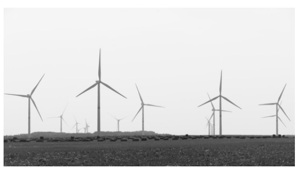
New ocean multi-use project UNITED had its Kick-Off meeting

A new scientific paper has been published by some of the members of the SUBMARINER Network Mussels Working Group: 'Cleaning up seas using blue growth initiatives: Mussel farming for eutrophication control in the Baltic Sea'. It is now open access. Read more .