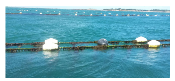
Best seaweed farming technologies – Dutch example

Commercially viable sea farming requires high-tech machinery and management systems to optimise production. Researchers, engineers, operators, IT developers and others need to collaborate to develop the required equipment and find a way to make it available for all farmers. Read more.