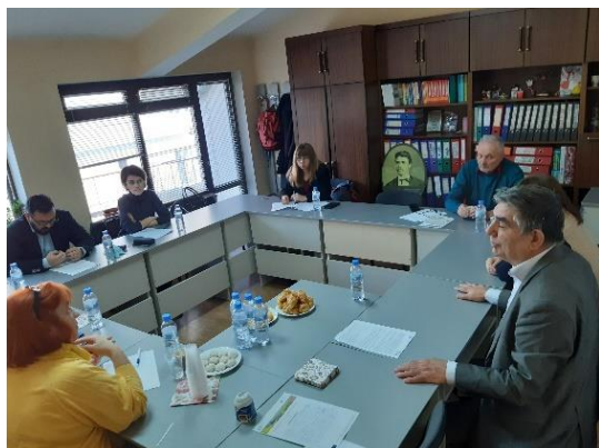
Figure 3: Meetings with the members of the regional SWG in Stara Zagora

As a result of the BE-Rural project activities, a regional Stakeholder Working Group (SWG) was created which includes representatives of regional and local authorities, business, science and civil society organizations in the relevant areas related to the bioeconomy. The members of the SWG took an active part in the development of the strategy document. Several meetings and discussions were held to identify development objectives and options for achieving them. During the workshops, the EU’s priorities for the development of the bioeconomy, as well as the results of the PESTEL analysis and the business models assessed within the BE-Rural project were presented and discussed.