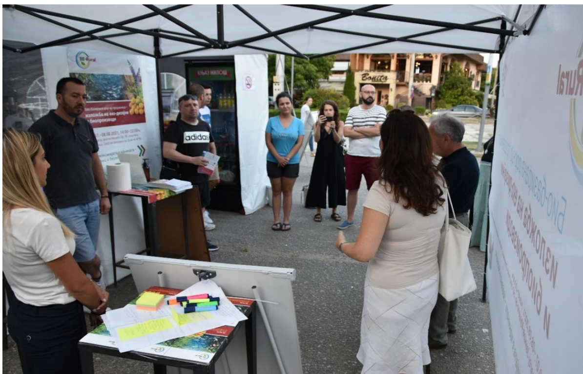
Figure 4: Workshop organized within in the frame of BE-Rural's bio-based pop-up store in the municipality of Strumica

The draft structure and contents of the bioeconomy roadmap were discussed with key stakeholders in the beginning of July 2021. Afterwards, a public event entitled “World style cafe: Setting the ground for our bioeconomy roadmap” was organized as part of the temporary bio-based pop-up store that has been set up in Strumica. This event was organized on 31 st of July and welcomed around 15 stakeholders. The main goal of this event was twofold: Firstly, to obtain an understanding of what prevented the region from developing bioeconomy practices so far. This was helpful in order to devise appropriate actions, which should be part of the roadmap. Secondly, to identify the key stakeholders in the region who will be responsible for further developing the bioeconomy. As part of a brainstorming exercise, all ideas were put on post-it notes and two topics were selected for further discussion and elaboration: 1) what are the main barriers for bioeconomy deployment in the six focus areas, and 2) what is the importance of the focus areas which are most relevant to the Strumica region.