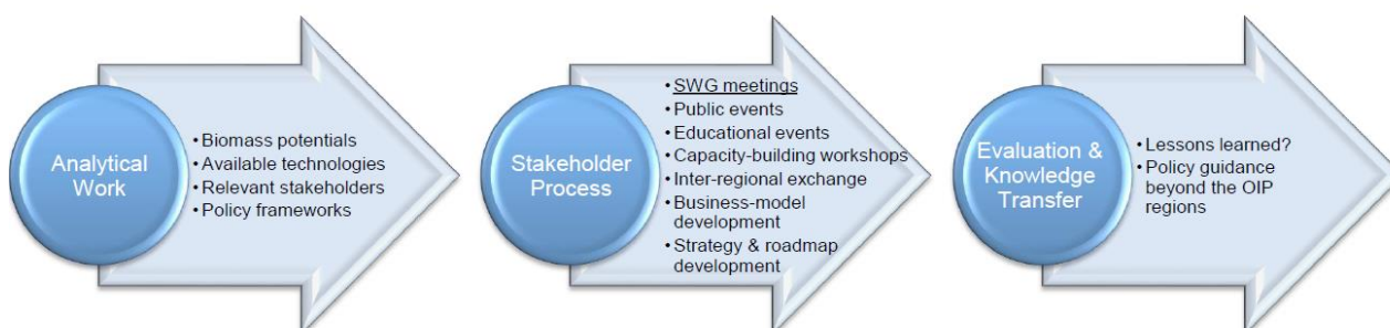
Figure 1: BE-Rural implementation phases

The strategy development was based on an extensive analysis of the policy frameworks and the biomass potentials of the regions. In parallel to the analytical work, the stakeholder process was kicked off by creating regional Stakeholder Working Groups responsible for the development of bioeconomy strategies and roadmaps. Dedicated capacity building and knowledge exchange activities were developed in a way to increase the capacities of regional/local authorities and stakeholders to design and implement bio-based roadmaps and strategies. In addition, pop-up stores with bio-based products and information about their impacts were organised to increase the awareness of the bioeconomy among the general public. Educational institutions were provided with teaching materials on the bioeconomy to support the development of dedicated curricula and were engaged through a number of educational events and through a summer school for teachers. Finally, the regional strategies and roadmaps were formulated by the members of the SWGs.