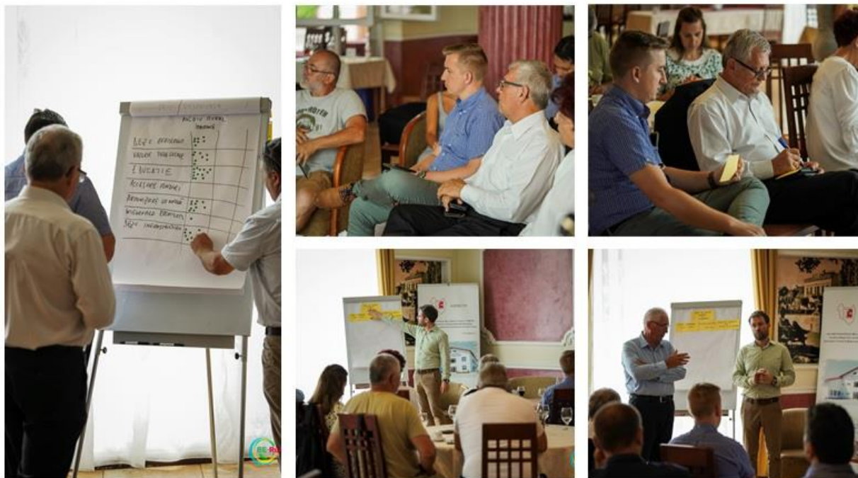
Figure 6: Participants to the SWG on principles and objectives of the roadmap for strengthening the bioeconomy in Sfantu Gheorghe, Covasna County